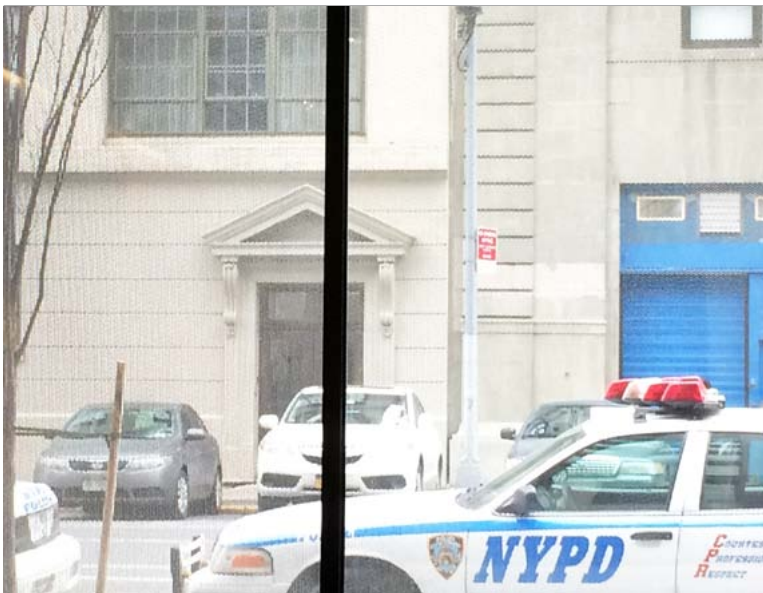
View from interior, 4ft distance from facade