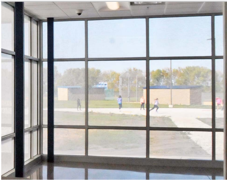
View from interior, 10ft distance from facade